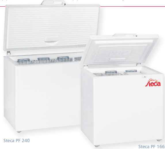
Steca PF 240